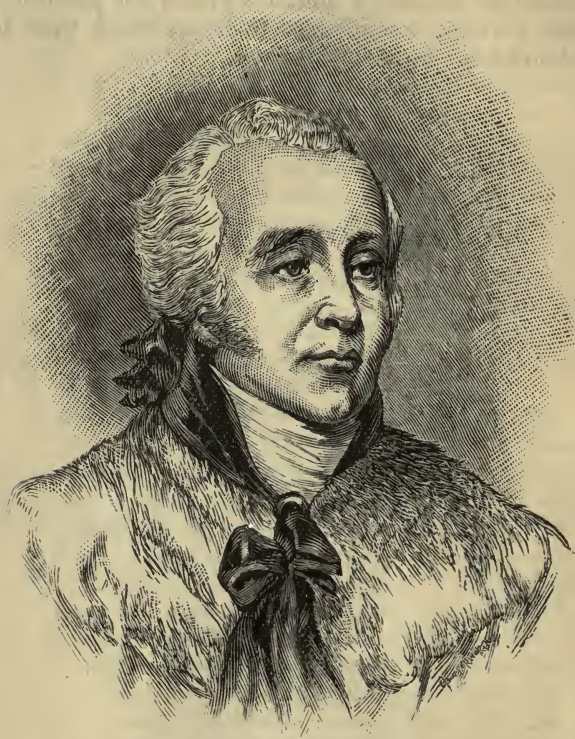
THE EARL OF MINTO.