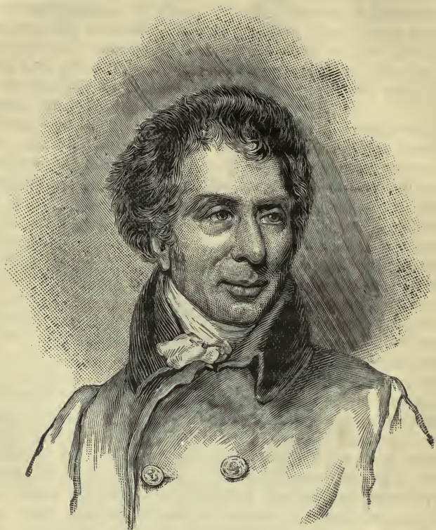
SIR JOHN SHORE : AFTERWARDS, LORD TEIGNMOUTH.