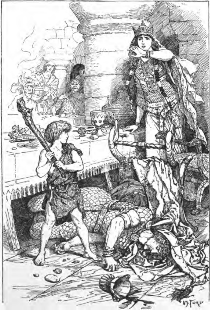
LITTLE BEVIS AVENGES HIS FATHER.