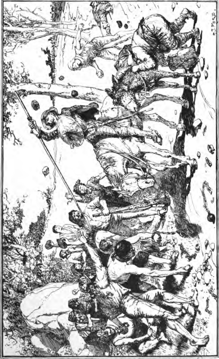
HOW THE GALLEY SLAVES REPAID DON QUIXOTE