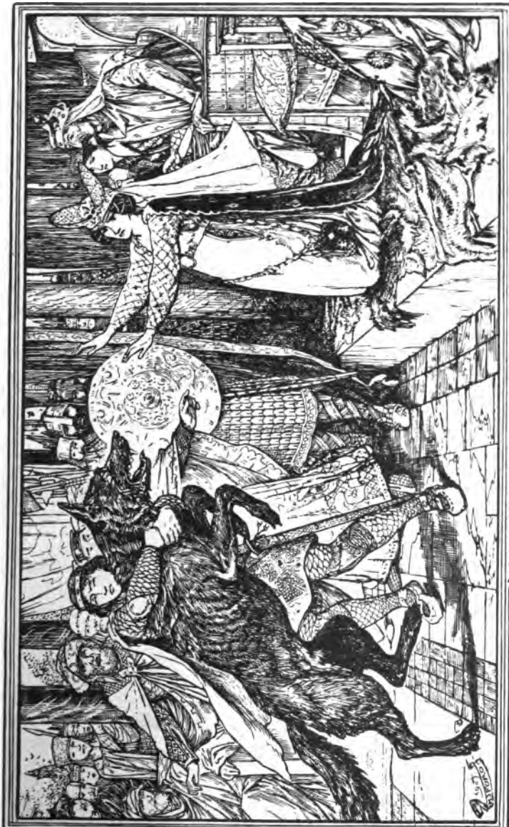
THE FURY OF THE WER-WOLF