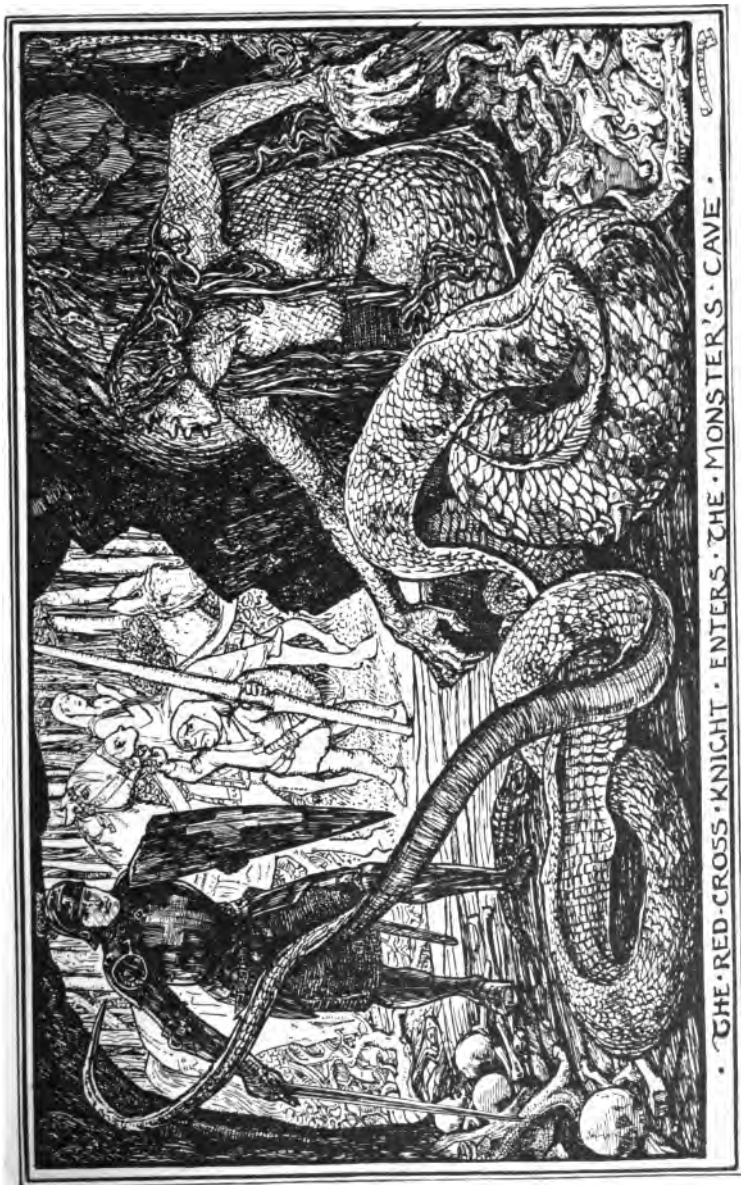
• THE RED-CROSS KNIGHT ENTERS THE MONSTER'S CAVE •