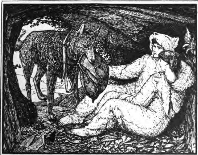
'The Werwolf's visit to the Cave

'Alas! sire, Melior has heard that in Greece royal brides pass their lives shut in a tower, and she has sworn that she will never wed one of that race. But, indeed, for my part, I think that is not her true reason, and that she has pledged her faith to another, whom you also know and love.'