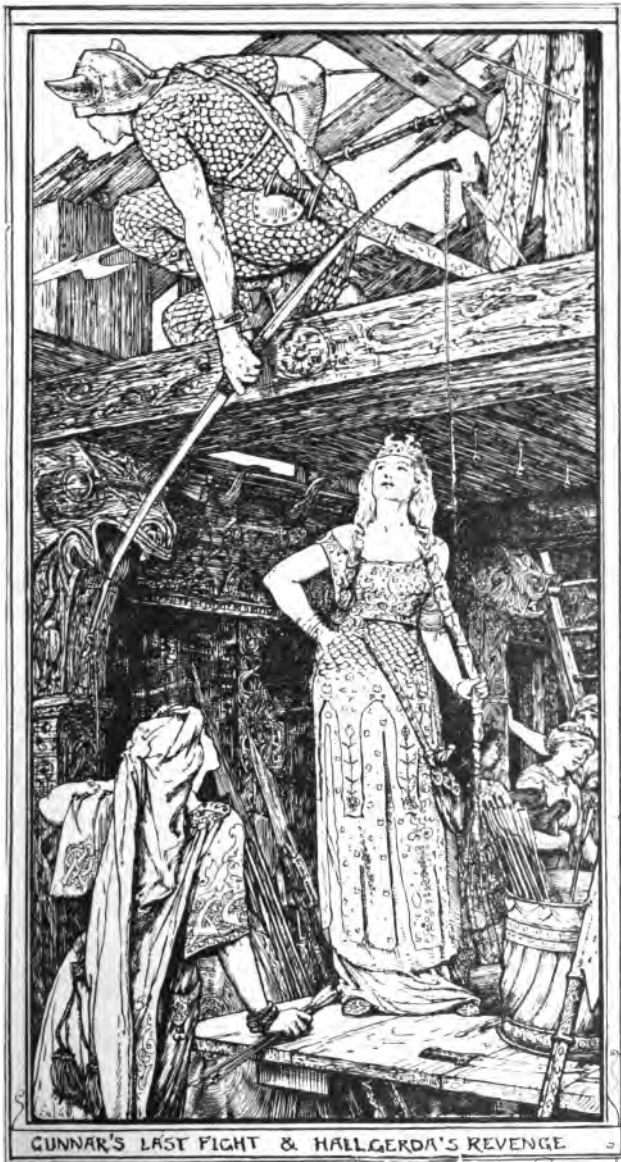
GUNNAR'S LAST FIGHT & HALLGERDA'S REVENGE.