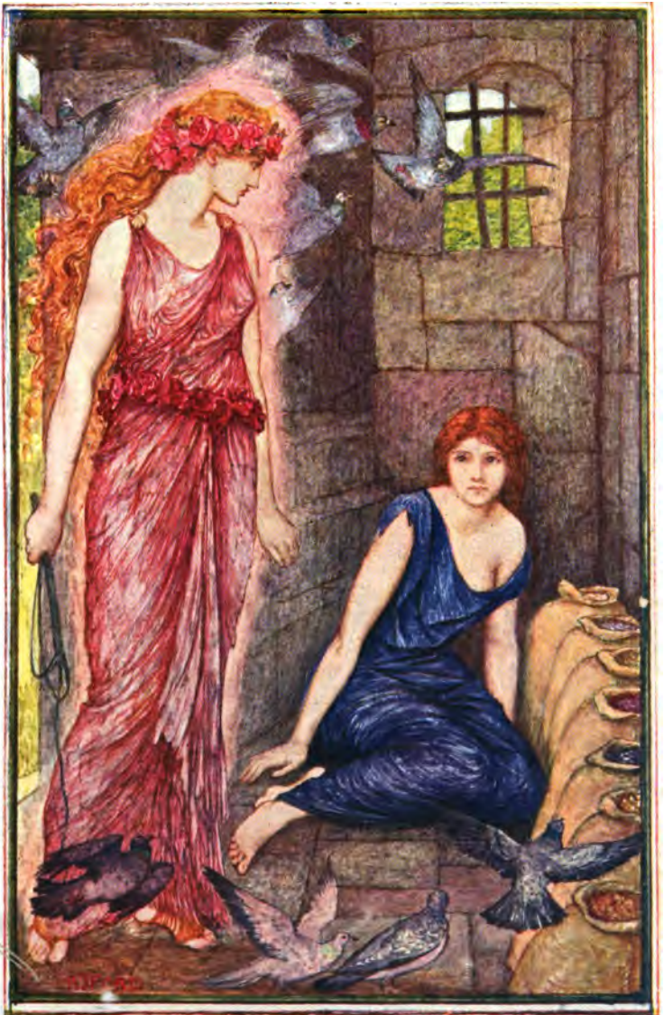
APHRODITE FINDS PSYCHE'S TASK ACCOMPLISHED.