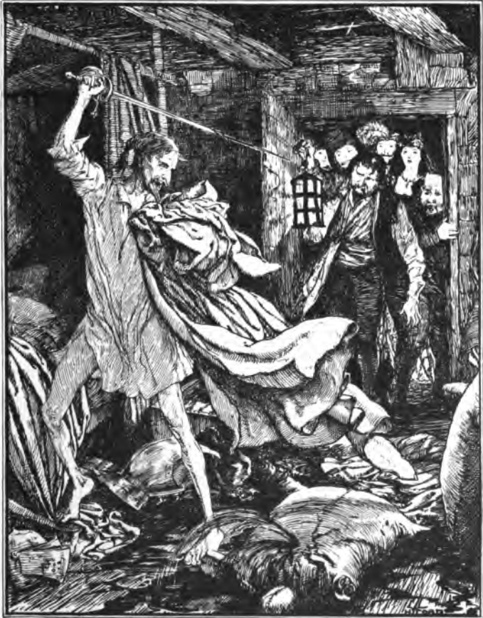
DON QUIXOTE'S BATTLE WITH THE WINE-SKINS

will your sword avail you'; then followed loud blows against the wall.