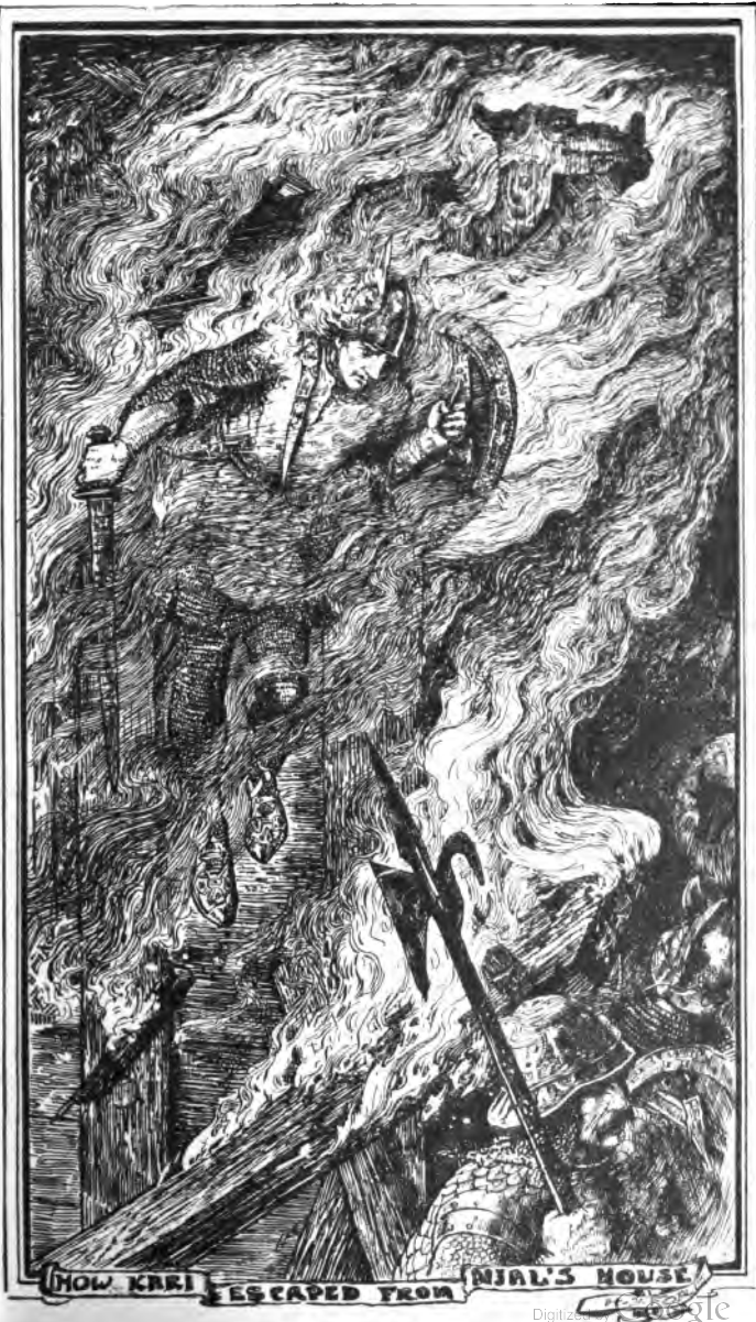
HOW KARI ESCAPED FROM NJIAL'S HOUSE