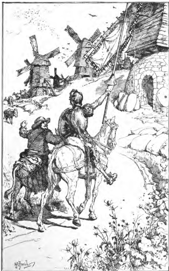
DON QUIXOTE DETERMINES TO ATTACK THE WINDMILLS