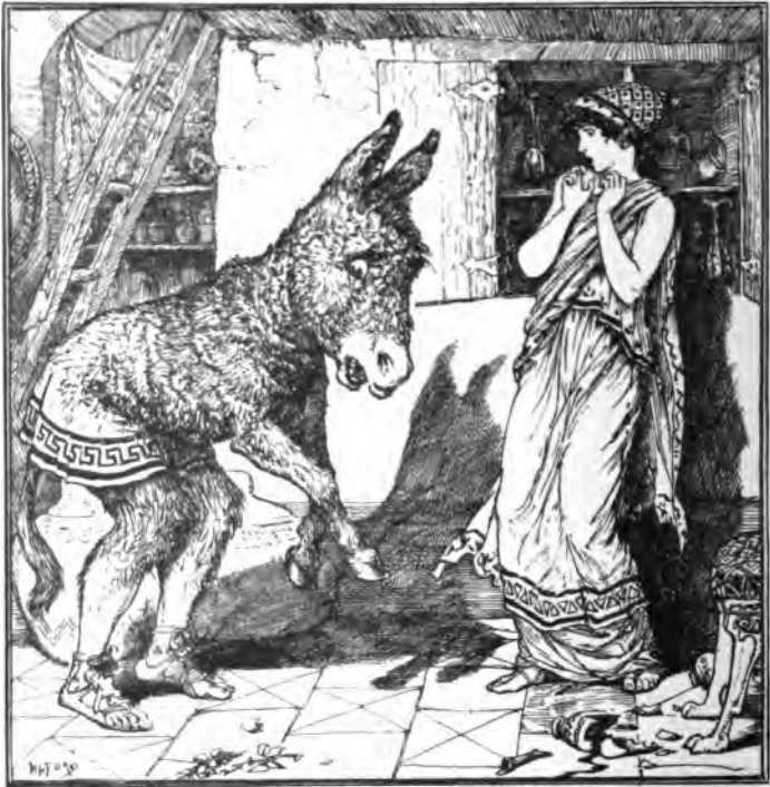
APULEIUS CHANGES INTO AN ASS

'Come hither, and quickly,' she said; and without