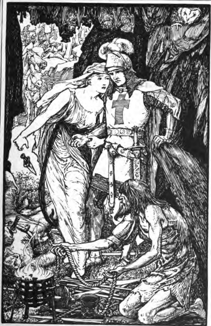
IN THE CAVE OF DESPAIR