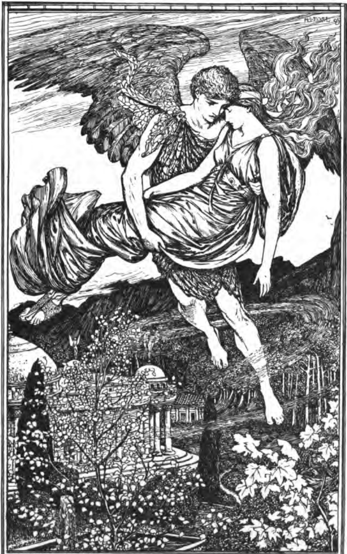
ZEPHYR CARRIES PSYCHE DOWN FROM THE MOUNTAIN