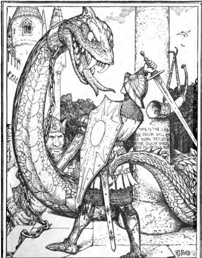
THE KNIGHT OF THE SUN FIGHTS THE SERPENT