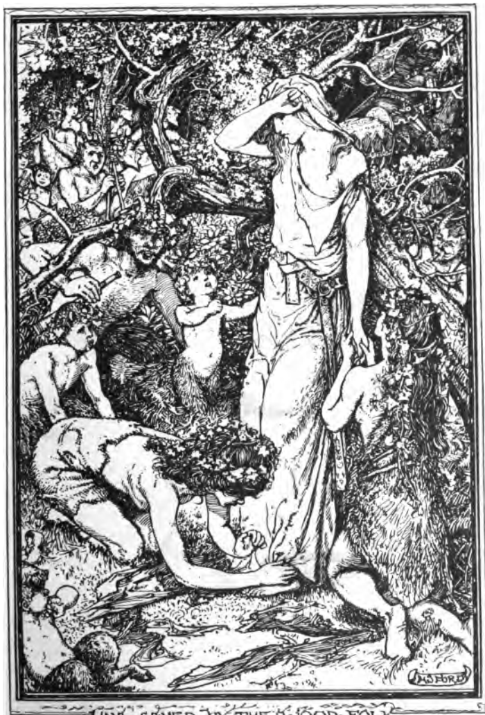
UNRESERVED BY THE WOOD-FOLK