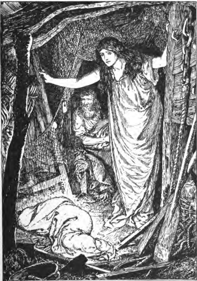
ROUND THE BAG WHICH HELD THE BOY A BRILLIANT LIGHT WAS SHINING