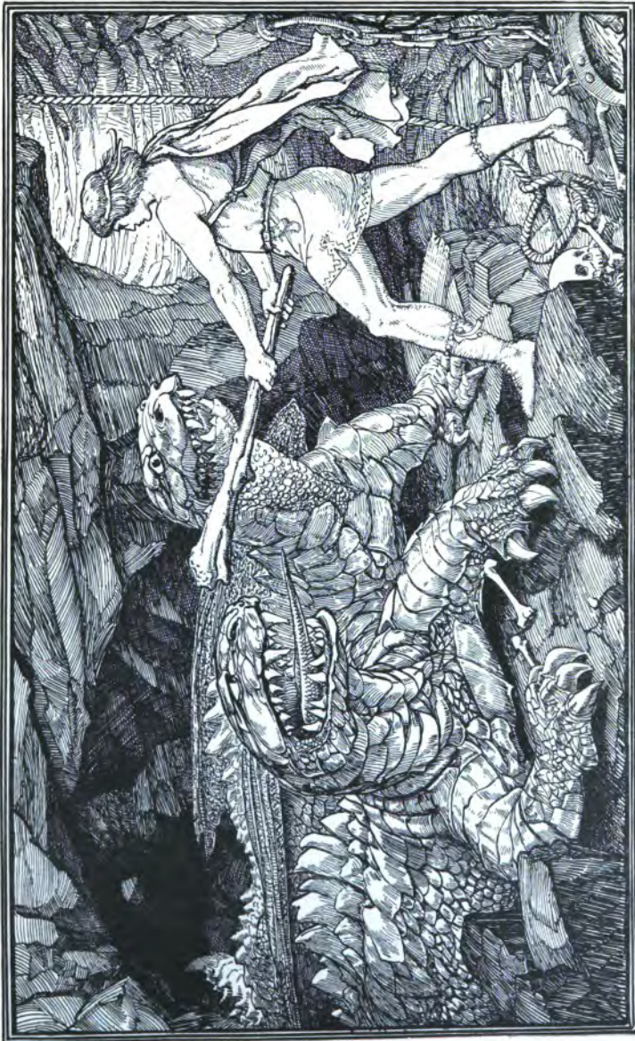
STRONG SIR BEVIS KEEPS THE TWO DRAGONS AT BAY