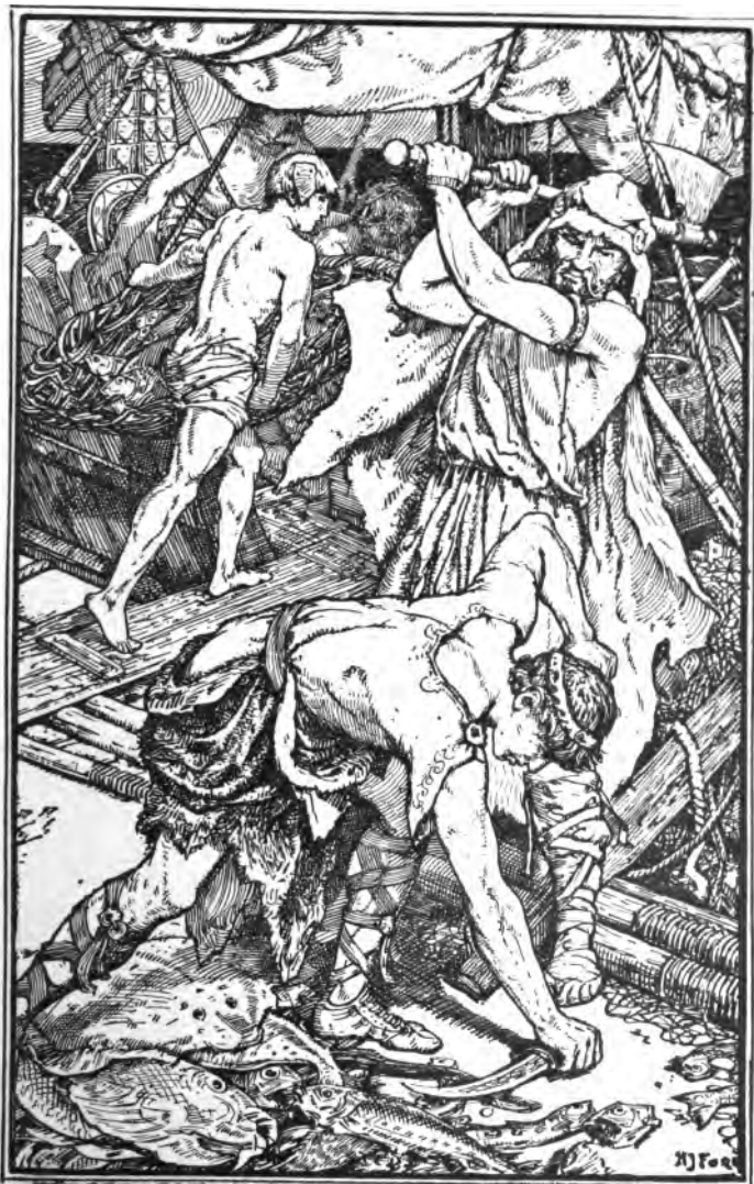
HOW THORWALD WAS SLAIN BY THIOSTOLF