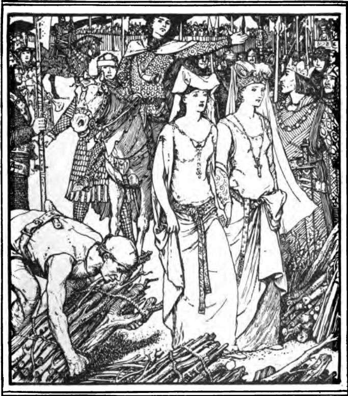
SIR AMYLE ARRIVES IN TIME TO SAVE THE LADIES

sword was keen, and he knew how to use it, and it was not long before he had given Sir Amyle a sharp thrust through the shoulder, and the young knight reeled in his