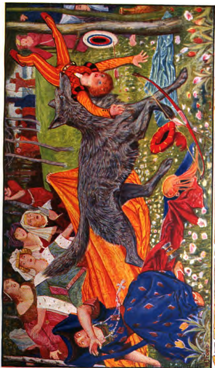
The War-wolf carries Prince William away