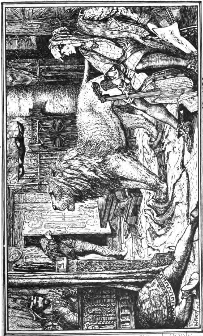
• DON DIEGO AND DON FERNAN SHOW THAT THEY ARE COWARDS •