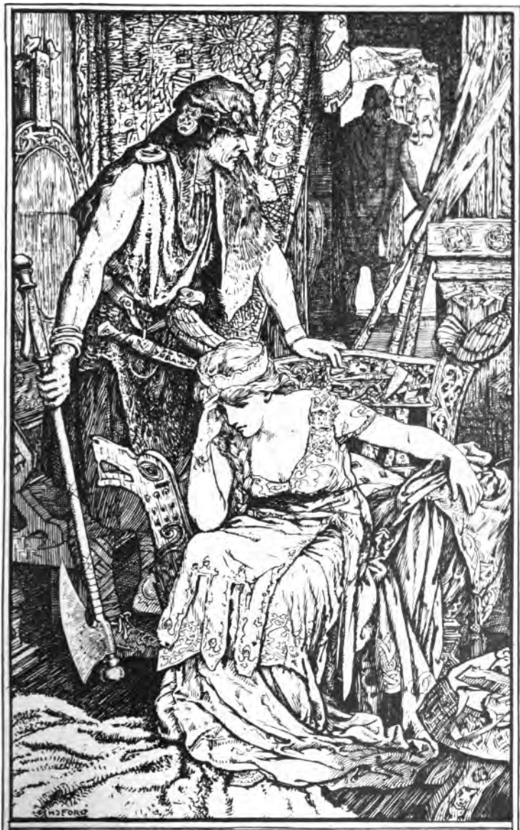
THIOSTOLF DECIDES TO SLAY GLUM