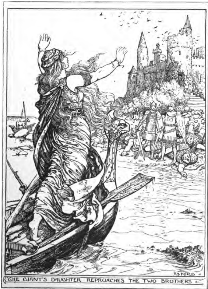
THE GIANT'S DAUGHTER REPROACHES THE TWO BROTHERS