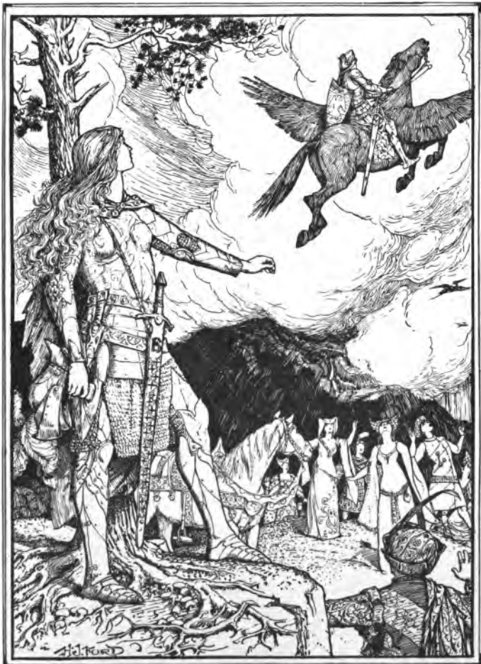
Roger borne away from Bradamante