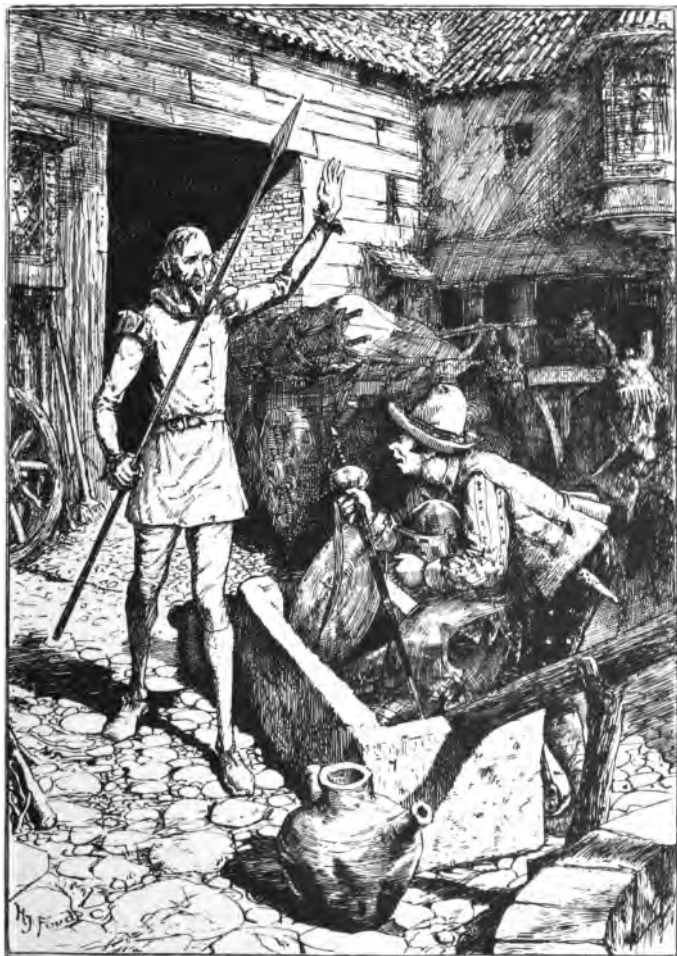
DON QUIXOTE BELABOURS THE MULETEER

he made excuses for the rude fellows, who had only got what they deserved, and said that, as there was no chapel to