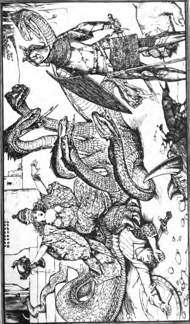
ARTHUR FIGHTS THE SEVEN-HEADED SERPENT