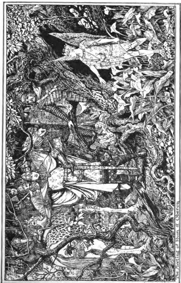
The Meeting of Huon & Oberon