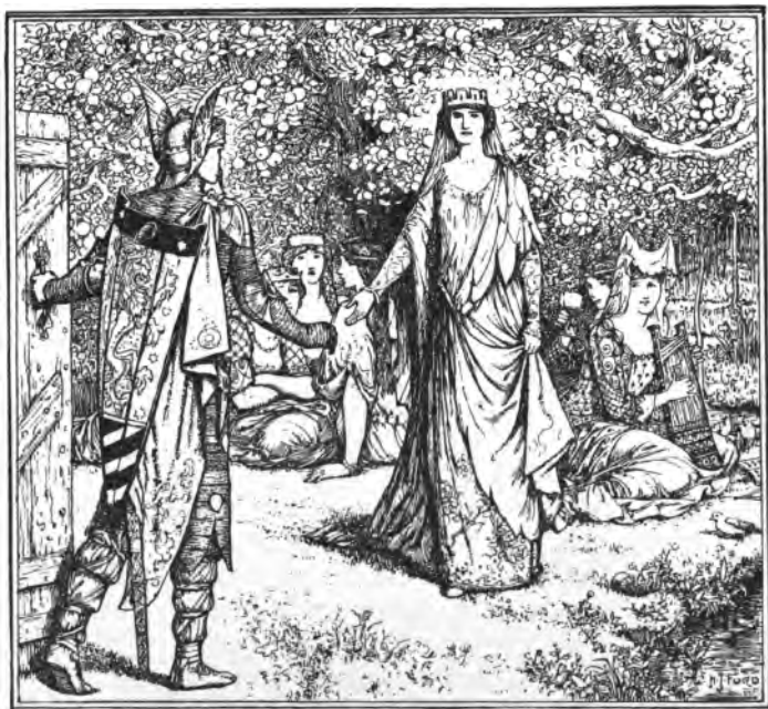
OGIER THE DANE MEETS MORGANE LE FAY AT LAST

She held out her hand, and Ogier placed his within it, and thus they entered the castle. Then she went to her